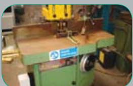
WADKIN BURSGREEN BEM Spindle Moulder with Cutters. £1650