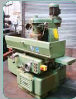
ABWOOD SG 4H Vertical Spindle segmental wheel Surface grinder, Mag chuck 18" X 6" C/w coolant. £1450