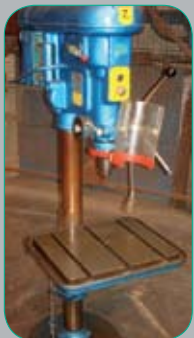
FOBCO 7/8 Pillar Drill Table 380 x 460 mm, Spindle Speeds 51-2650rpm. £1250