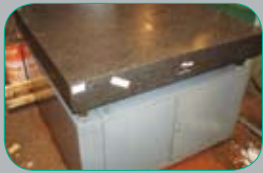
GRANITE TABLE Grade A1 Cert 4ft x 4ft, On its own base. £1650