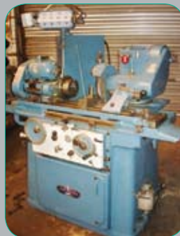
JONES & SHIPMAN 1310 Universal Grinder 8" x 18" b.c. £2950