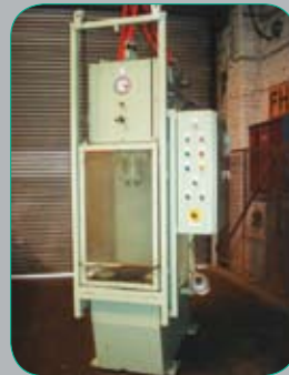
EDBRO 50TON 'C' Frame Hydraulic Press, on a Hand and Auto operation. £7750