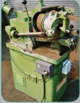
ARCHDALE 3" DRILLGRINDER 3" Capacity. £1750

CINCINNATI TOOL & CUTTER GRINDER. £POA VARIOUS DOUBLE ENDED GRINDERS IN STOCK.