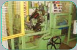
SUNDERLAND 5A Gear Planer, with full set of changes wheels. Recently Rebuilt. £POA