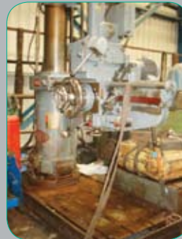
ASQUITH OD1 5ft Radial Arm Drill with Box Table 3" drilling capacity. £5250