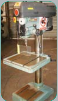
J & L FMT-81000 Pillar Drill Table 460 x 400mm, 2 morse taper Spindle, Power feed Excellent condition. £1650