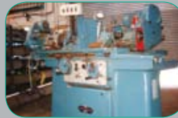
JONES & SHIPMAN 1300 EIT Universal Cylindrical Grinder, Swing 254 mm X 686 mm b.c, C/w equipment & Coolant system. £4500