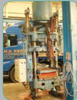
DANIEL 300 TON 4POST HYDRAULIC PRESS 31" x 31" Table, 18" dia Ram with 20" stroke. £POA