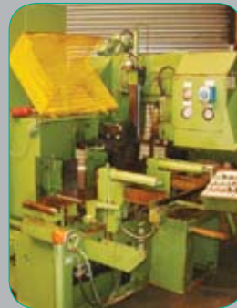
FORTE SBA 241 Twin column Automatic Bandsaw 250mm Capacity, Ex Aerospace, VGC. £4950