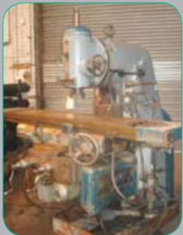
PARKSON 3V SWIVEL HEAD VERTICAL MILLER Table 70" x 16", long travel 40", 50int spindle. £4750