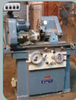
JONES & SHIPMAN 1311 EIU Universal Cylindrical Grinder, Swing 254 mm x 457mm b.c C/w 3 jaw chuck, radius dresser. £5250