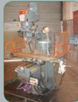
PINNACLE PM 2M Turret Mill with tooling & DRO new 1998 Ex MOD. £3950