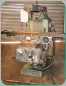
AJAX CLEVELAND No.2 Universal Mill with vertical swivel head, Table 1400 mm x 340 mm, C/w horizontal Arbor. £3950