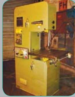
STARTRITE 216 Vertical Bandsaw, Table 26" x 26" C/w Blade welder. Ex University. £2250

STARTRITE VOLANT 14 Vertical Bandsaw, Table 480 x 480 mm, C/w Blade welder. £1450