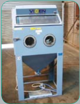
VIXEN FOX 25 DRY BLAST UNIT 1 Phase New 2004 Ex Aerospace. £1250