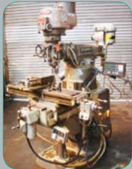
BRIDGEPORT TURRET MILL with vari speed head, table size 49 x 9" Good condition. Choice from £2750