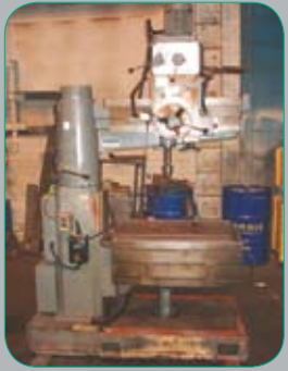
POLLARD 480 Radial Drill with Rise & Fall Table, 1000mm 4mt Spindle. £1950