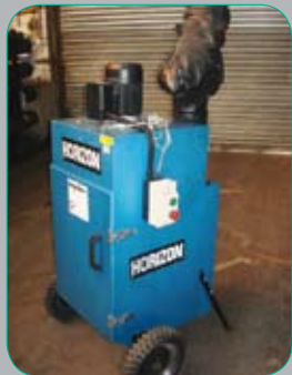
HORIZON SMOG EATER SM10 Single phase mobile fume extractor. Ex MOD. £850