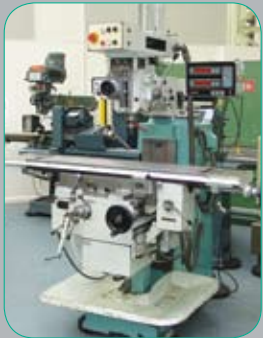
TOS FNK 25A Turret Mill Table 1250mm x 290mm, C/w DRO £4950