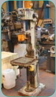
POLLARD PILLAR DRILL 2 Morse Taper spindle, Ex Aerospace. £750