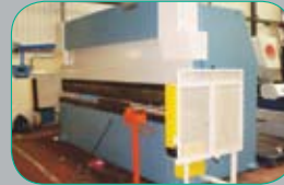
KINGSLAND EURO MASTER 200 ton x 4300 mm, 3750 mm between side frame CNC Press Brake with 3 axis BC40 Control (x, y1, y2) C/w tooling. £24500

STARTRITE VOLANT 14 Vertical Bandsaw, Table 480 x 480 mm, C/w Blade welder. £1450