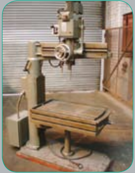
POLLARD 2NY Radial Drill with elevating table 36", 2mt spindle. £1450