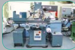
JONES & SHIPMAN 1400LA Horizontal Surface Grinder, Mag chuck 610mm x 200mm, Very good condition. £11250