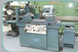
JONES & SHIPMAN 1300EIT Universal Cylindrical Grinder, Swing 10" x 27" b.c, C/w equipment & coolant. £14950